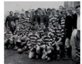
1964 Rugby - PP's v FP's