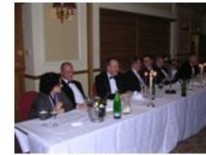
2005 Annual Dinner

By maintaining a database of around 2,500 former pupils, the Club keeps members informed of the social events arranged by the Committee: the Annual Dinner in March, the Leavers' Gathering in August and the informal November Drinks.