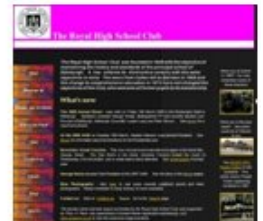
Website home page