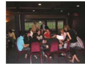
2005 School Leavers Party