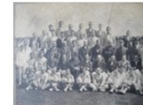
1921 Memorial field opening