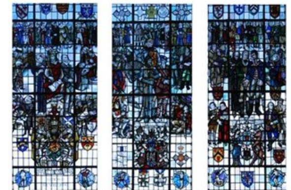
The 2 nd World War Memorial windows in the Barrton Assembly Hall were originally installed in Regent Road in 1948