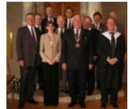
2007 Prize Giving